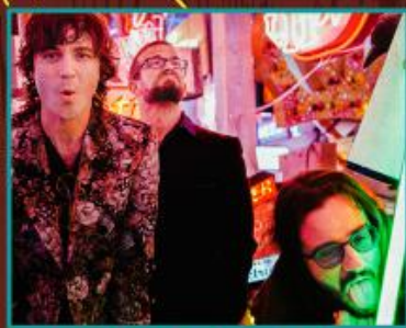
STRUNG LIKE A HORSE

JBE SUMMITFEST • BOULDER, CO • THURS TUNES • DRINKS • BITES • SNACKS • S'MORES PRIZE GIVEAWAYS!